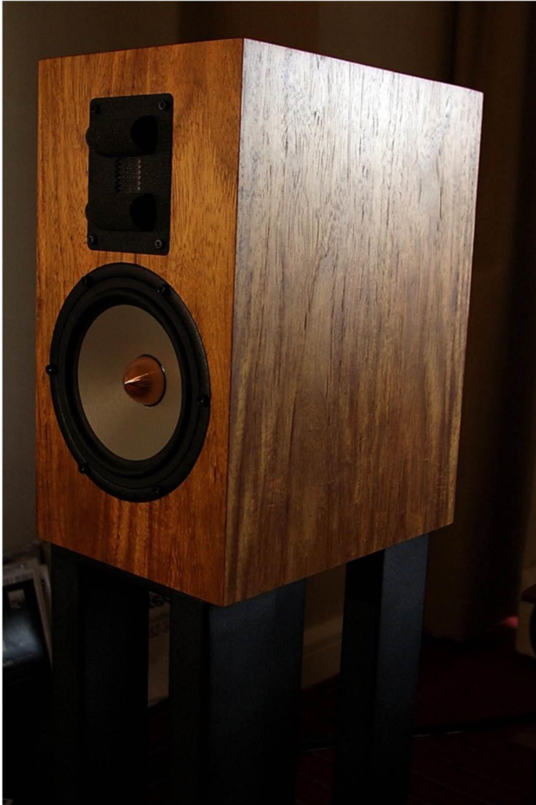
Brigadiers Audio BA2 standmount is just crazy good.