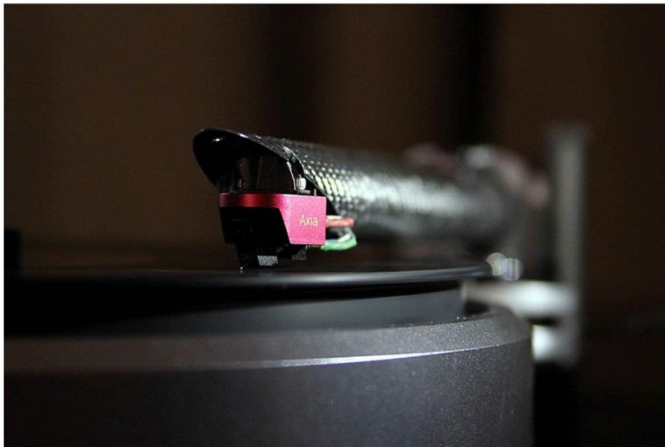
The Wand 10.3 Master Series tonearm

The system comprised the Brigadiers Audio BA2 loudspeakers ($12,000 p/pair), the PureAudio Duo 2 power amplifier ($9,500 USD), PureAudio Control pre-amp ($9,500 USD), PureAudio Vinyl phono pre-amp ($4,500 USD), the Mark Döhm Helix 1 turntable ($40,000 USD), The Wand Tonearm 10.3 Master Series (TBD approx. $2,500 USD), Les Davis Audio 3D2 constrained-layer dampers ($125 USD per/12 pack), and Furutech cabling, and power line conditioner Ftp-615 (approx. $725 USD).