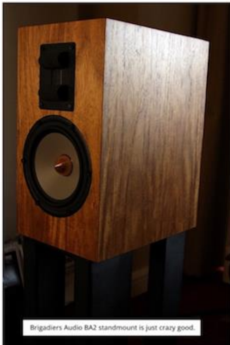
Brigadiers Audio BA2 standmount is just crazy good.